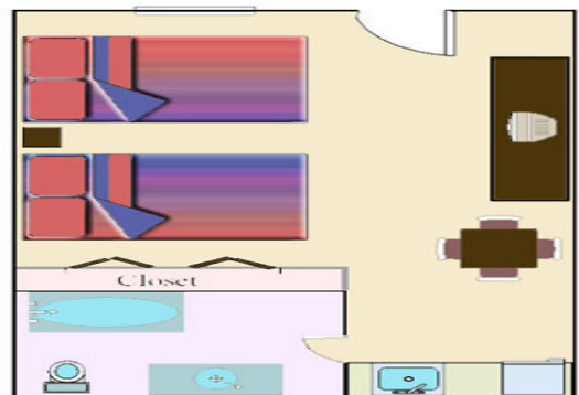
Westgate River Ranch Inn Room